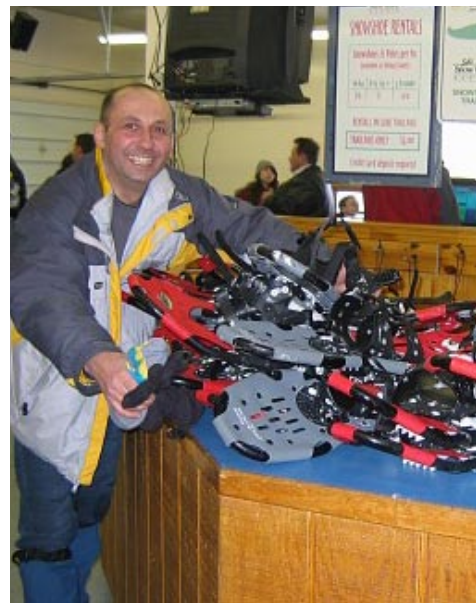
Intro to snowshoeing & tubing