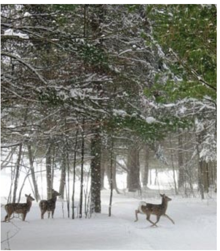
Winter weekend at Camp Tawingo

Check out the volunteer page at: http://www.torontooutdoorclub.com/aboutus/officers.asp