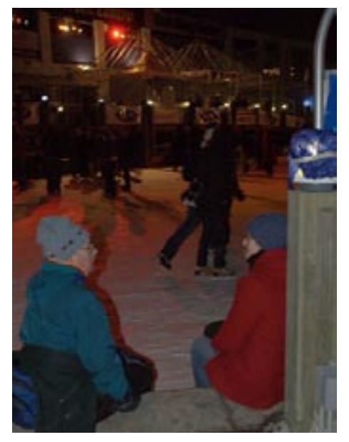
Waterfront DJ Skate @ Harbourfront