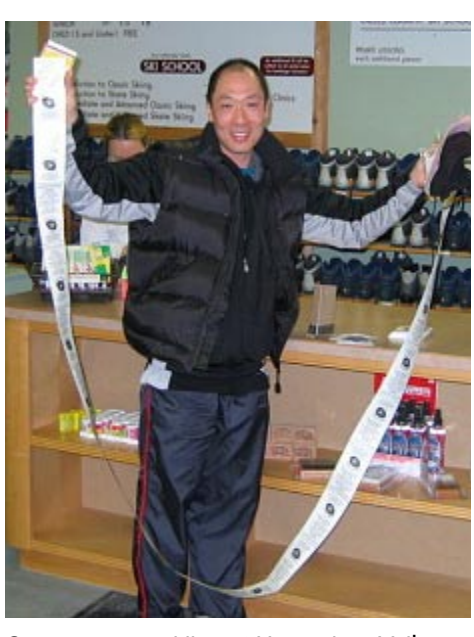
Cross-country skiing at Horseshoe Valley