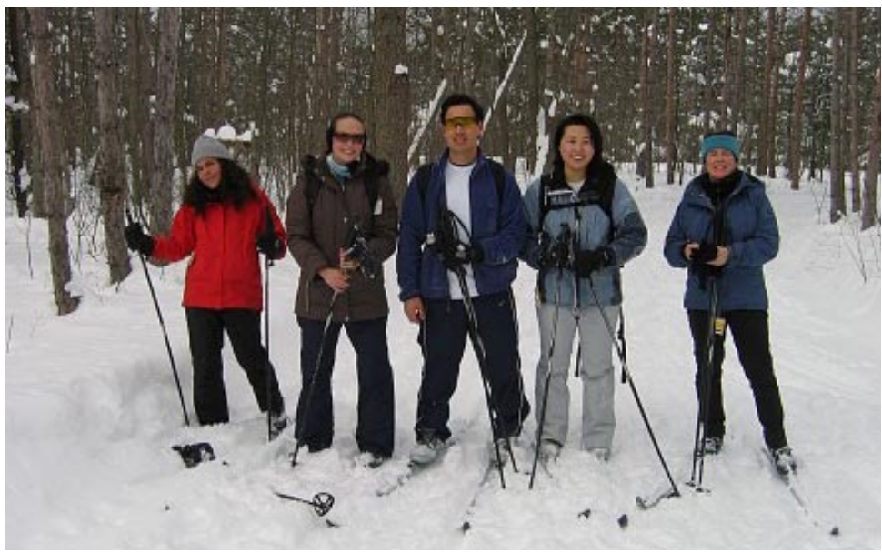
Cross-country skiing at Horseshoe Valley February 2007 Events