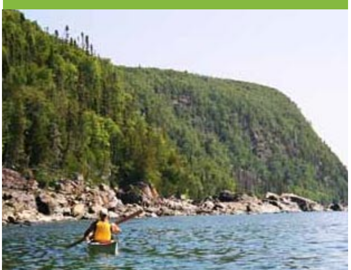
North shore of Lake Superior