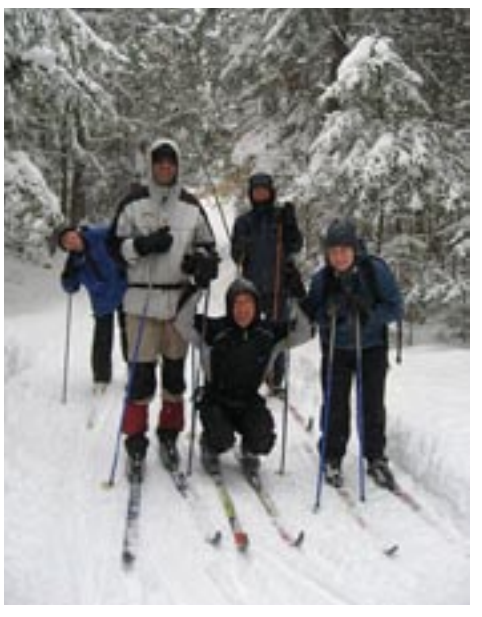
Winter weekend at Camp Tawingo