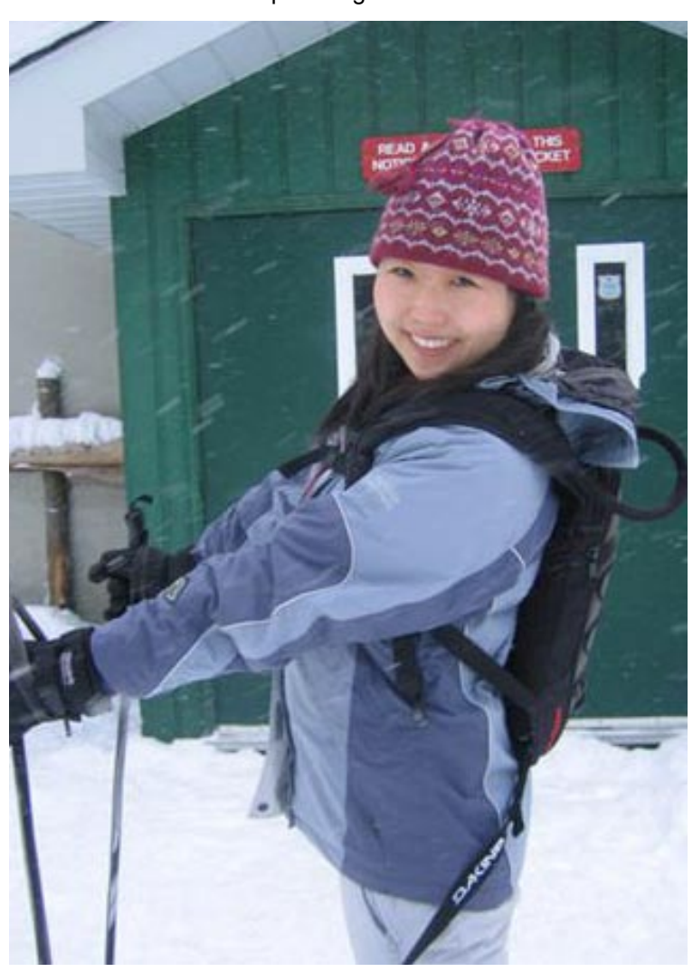
Cross-country skiing at Horseshoe Valley