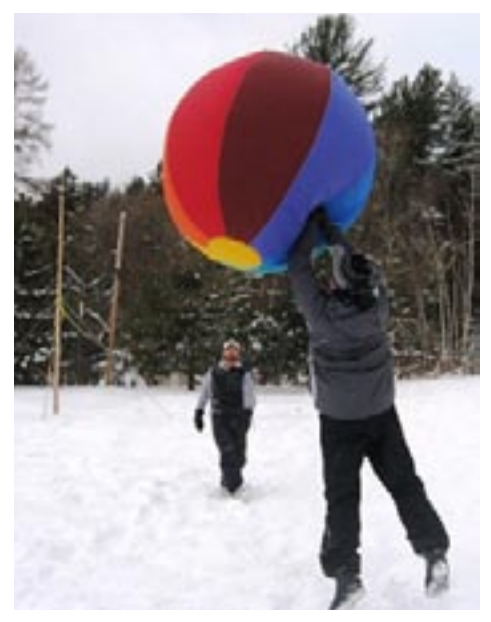
Winter weekend at Camp Tawingo